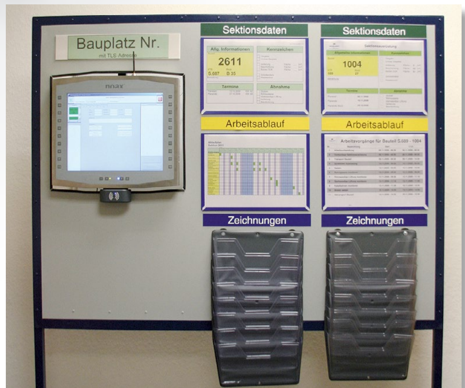
The visualisation boards at Meyer Werft serve as important information interface between different working groups.