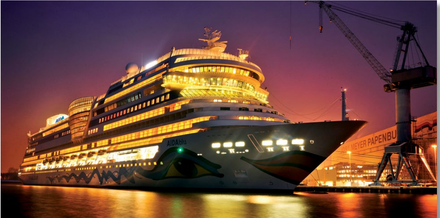
The club ship AIDAblu, delivered in February 2010.